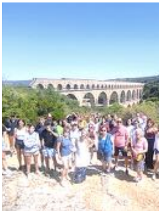
MEET INTERNATIONAL STUDENTS