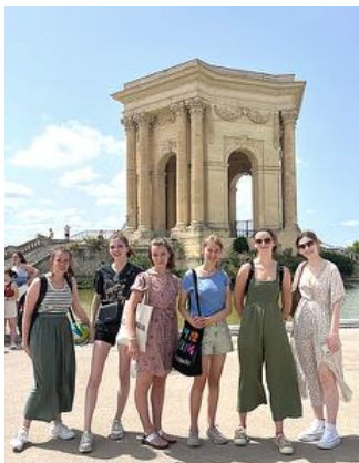
DISCOVER MONTPELLIER AND ITS REGION

There are so many things to see and do! Every week we offer a rich and varied cultural programme to meet other students, practice your French and discover the region!