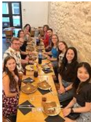
MEET FRENCH PEOPLE